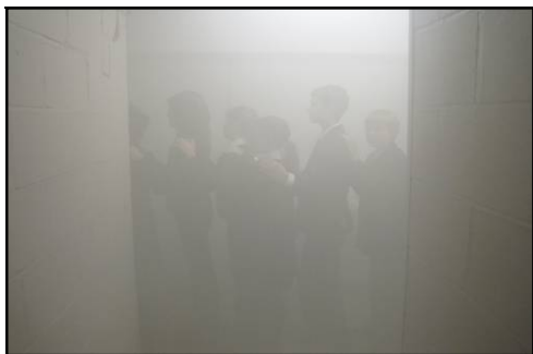
Students entering a smoke filled room

They then learnt resuscitation techniques and first aid basics. Pupils thoroughly enjoyed their sessions and followed up their learning by creating a fire plan for their own home. Hopefully these have been shared with parents!