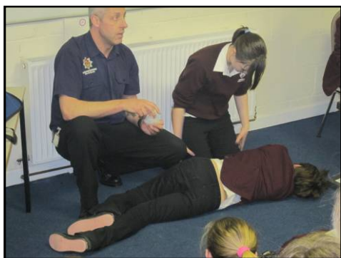
Practising the recovery position

For a FREE SMOKE ALARM please call 0800 180 41 40. In a fire emergency dial 999 for assistance.