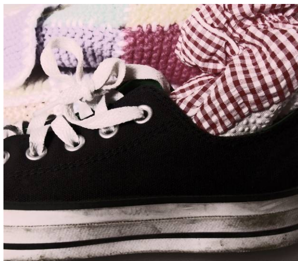
3 rd place photograph by Chloe Bacon